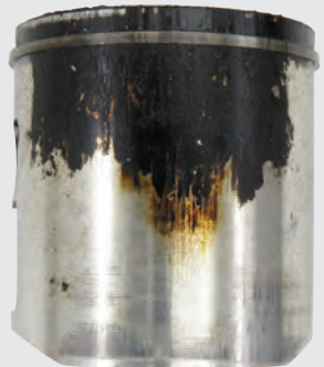
Leading Oil Brand 300 Hours