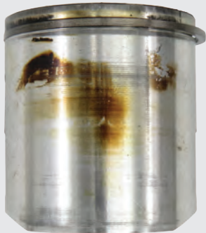
AMSOIL SABER Professional 300 Hours

Following 300 hours of professional-use testing in STIHL* string trimmers at the manufacturer mix ratio of 50:1, SABER Professional kept pistons and rings virtually free of carbon and wear (see the picture on the top), while use of a leading oil brand caused significant carbon buildup around the ring area (see the picture on the bottom). This engine is nearing the failure point.