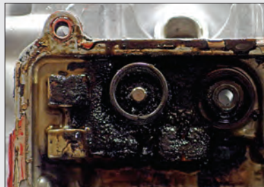
Leading Oil Brand 125 Hours