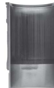
Severely Scuffed Liner