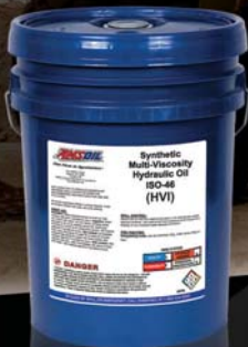
SYNTHETIC HYDRAULIC OIL