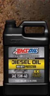
SYNTHETIC DIESEL OIL