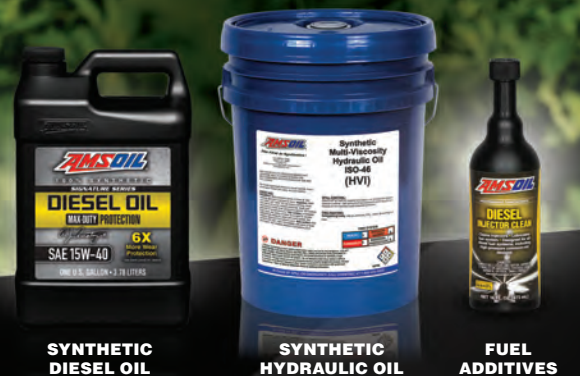
SYNTHETIC DIESEL OIL