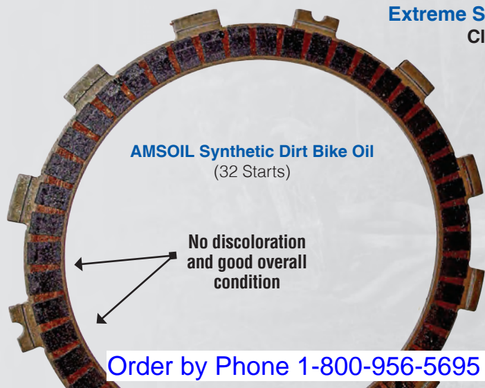
AMSOIL Synthetic Dirt Bike Oil (32 Starts)

No discoloration and good overall condition