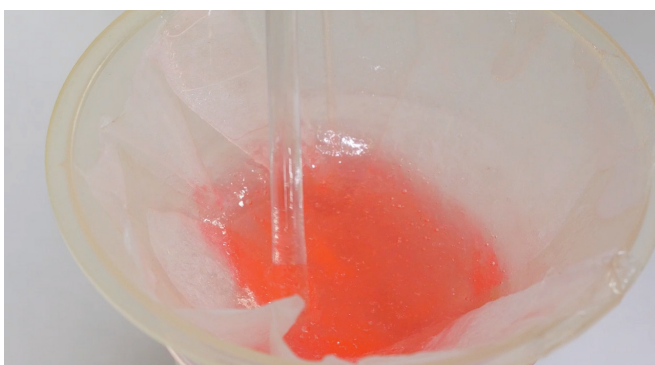
Wax formation in untreated diesel fuel plugs a coffee filter.