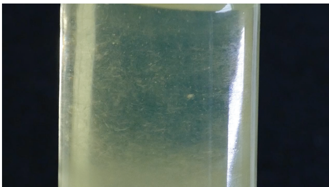
Wax crystals in untreated diesel fuel. The wax crystals will eventually fall out of solution and plug the fuel filter.